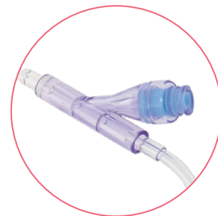
Needleless Access Site